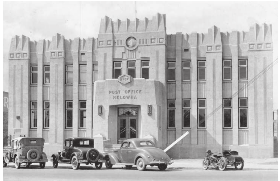
Kelowna Post Office

Explore protective mechanisms for other potential heritage neighbourhoods.