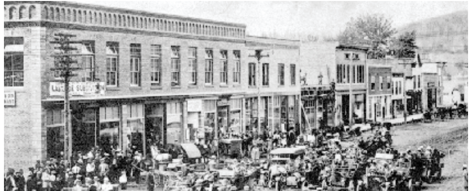
Main Street c.1912,

Continue to preserve and protect significant heritage resources through the use of protection tools and heritage planning initiatives.