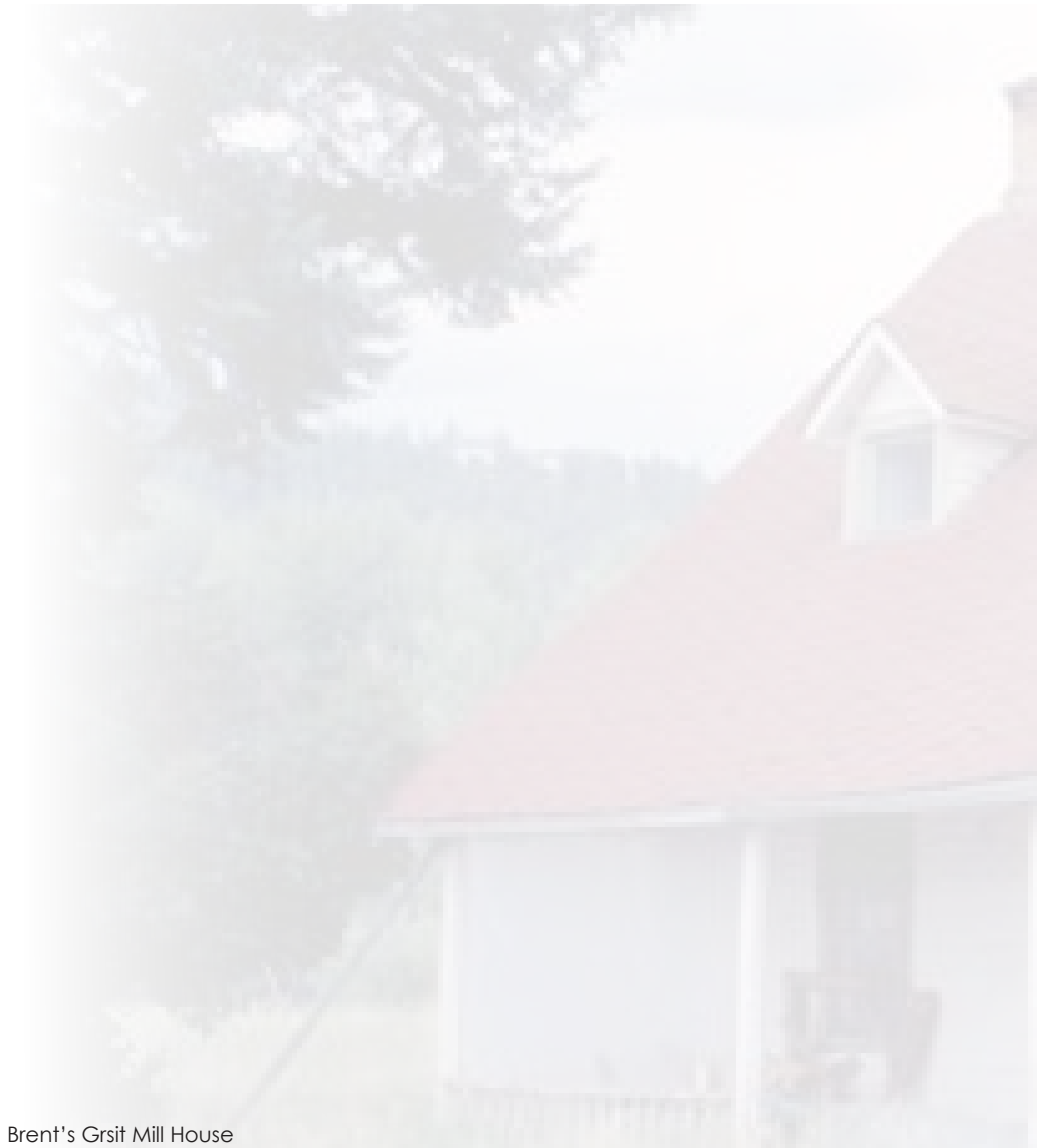
Brent's Grsit Mill House