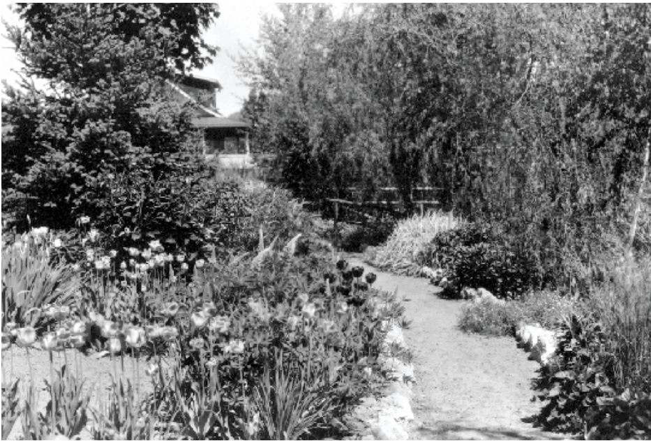
Kelwona Garden, c.1920s

4. DO you have any comments or suggestions about today's open house?