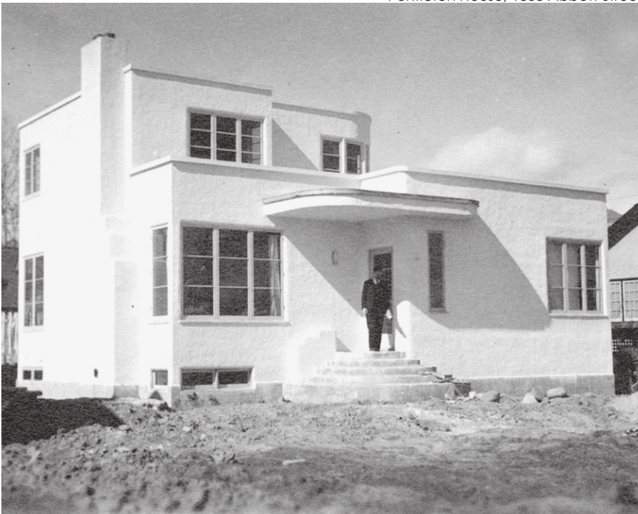
Penticton House, 1858 Abbott Street