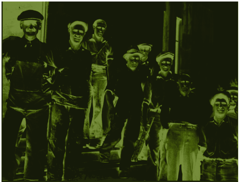
Kelowna Construction Crew