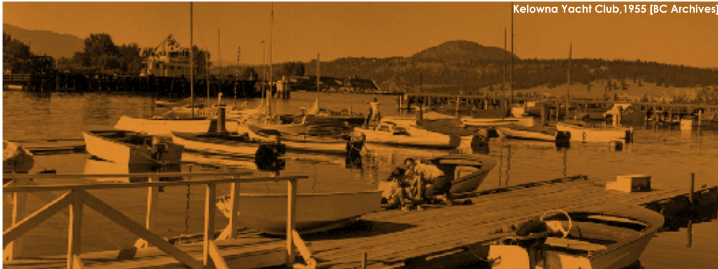
Kelowna Yacht Club, 1955