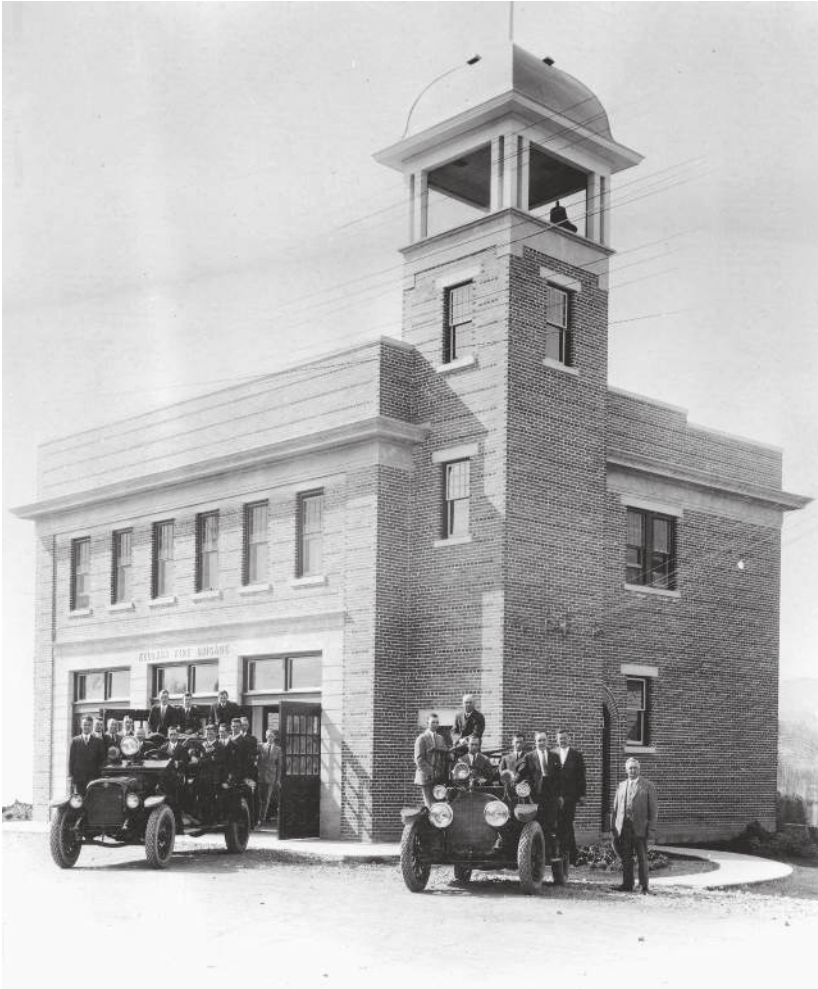
Kelowna Fire Hall

Develop a program of ongoing monitoring and renewal of the heritage program.