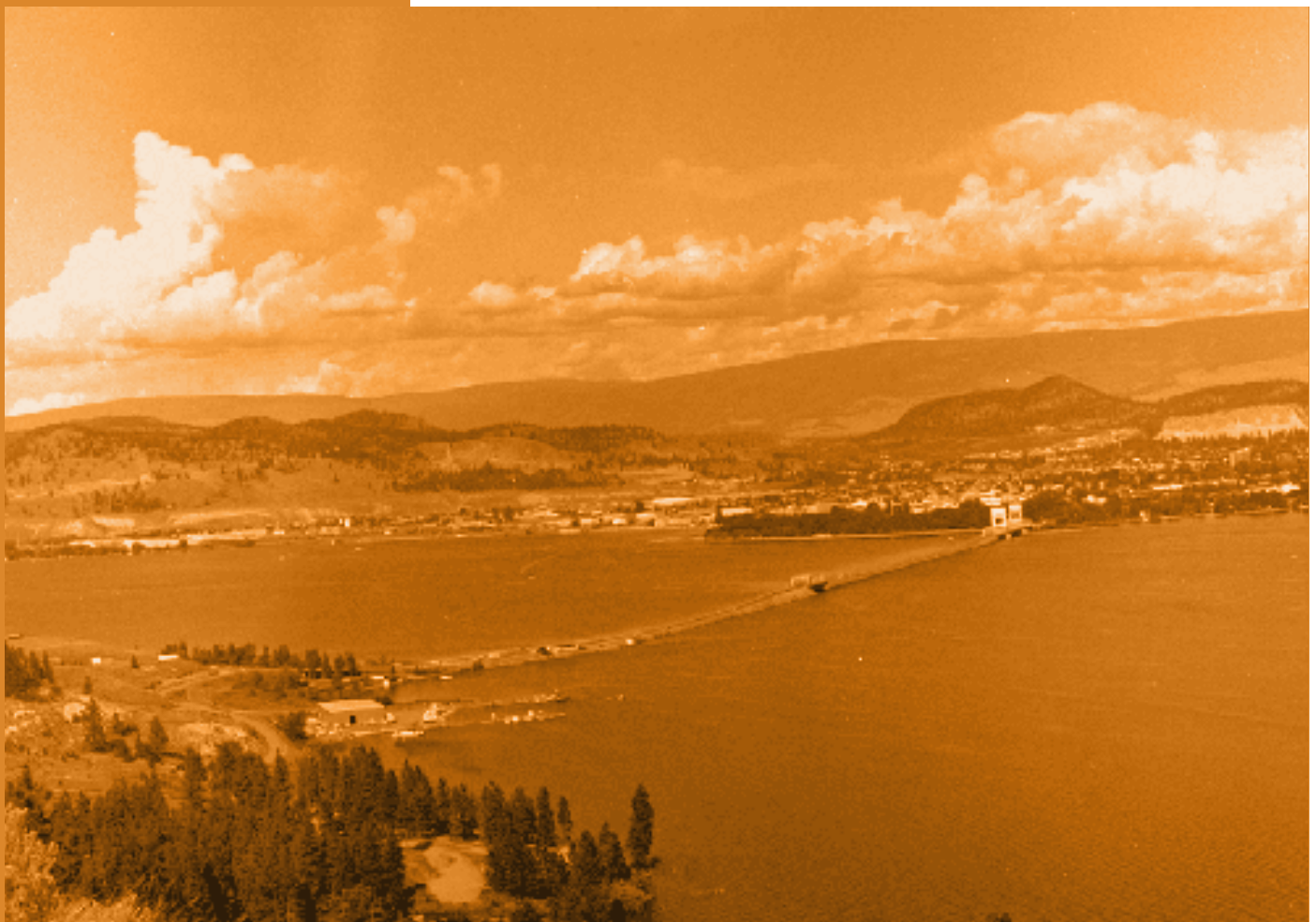
Kelowna's Floating Bridge, 1976