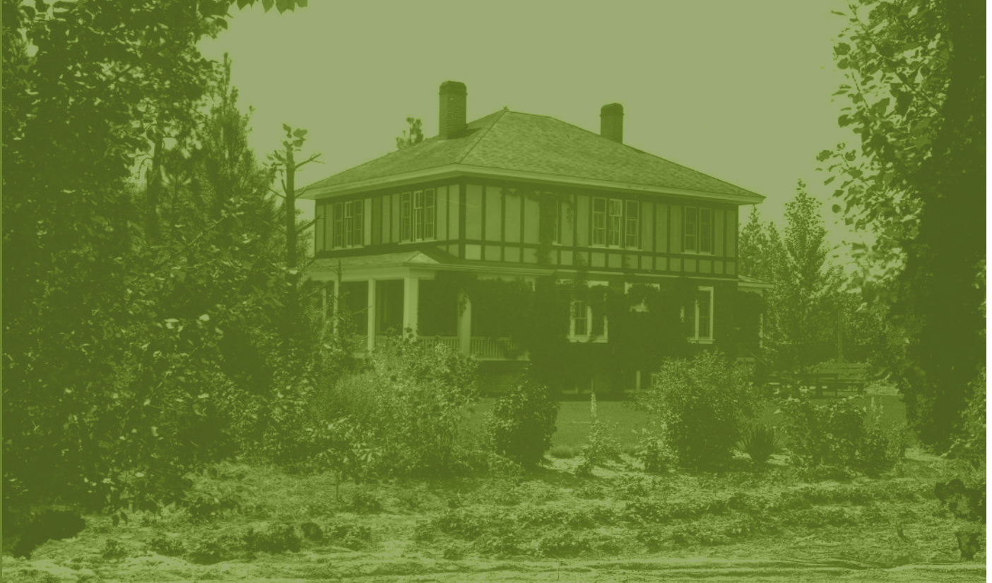
Belgo House, 1590-1640 Belgo Road