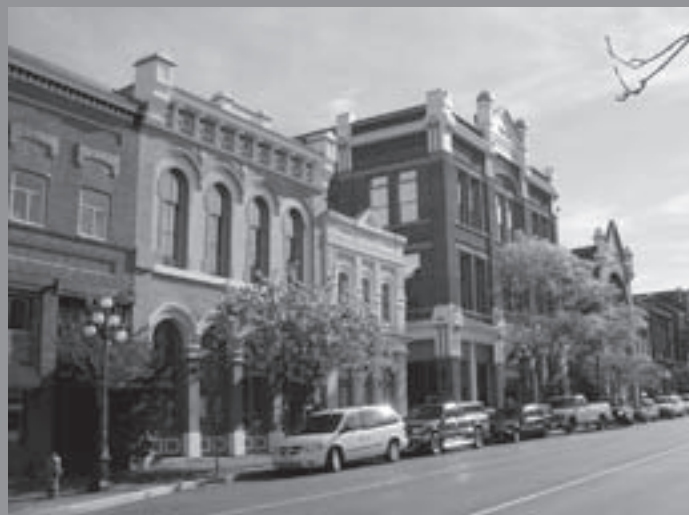
Lower Yates Street exhibits many of the defining characteristics common to the old commercial district