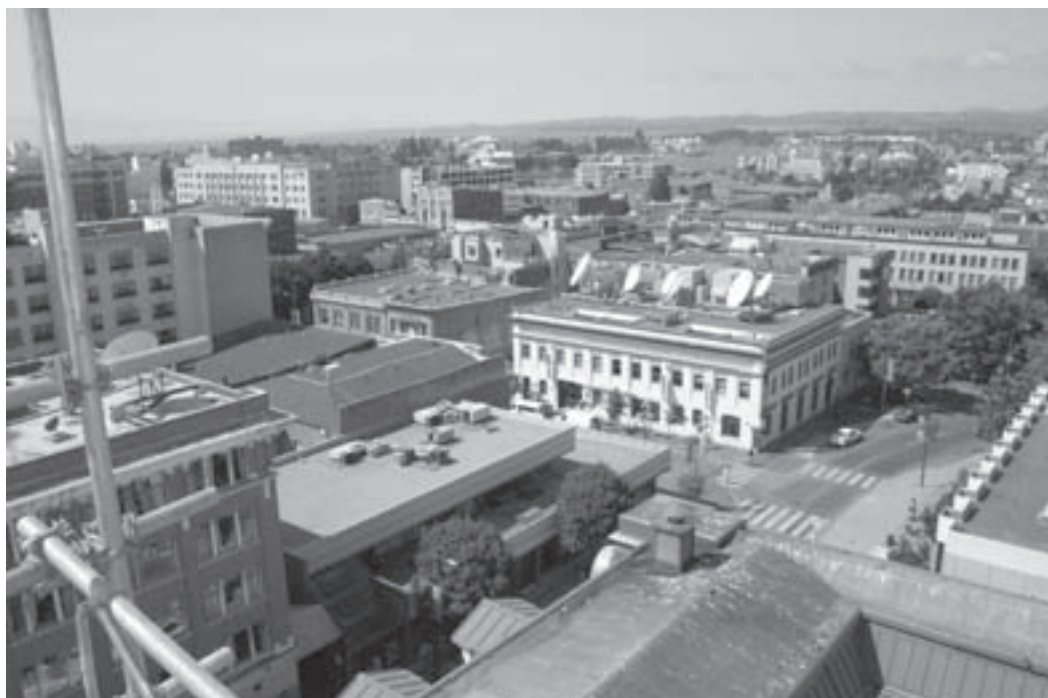
Old Town seen from the clock tower of City Hall.

This guidance has been developed under the powers given to municipal governments in British Columbia, according to Section 919.1(1)(d) and (f) and 970.1(1)&(2) of the Local Government Act item ii., that allows Council to approve the particulars of the exterior design and finish of all buildings and structures, and to establish landscaping standards.