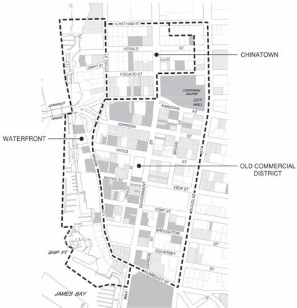
Character Areas and Effective Area of These Guidelines

For many years, design guides for new buildings in historic cities emphasized subservience to the past. Their key message was that design in a historic context must be imitative or meek - the commonly used words were “compatible with” and “subordinate to.” Buildings that followed such guidance often said little about the time in which they were designed – they ignored contemporary values. We are custodians, not curators, of the historic environment. Our city is evolving, it is not a museum object, and we have a duty in the design of new buildings, additions to non-heritage buildings, and new urban spaces to respond to changing ways of working, living and playing. Equally, in our search for contemporary urbanism in Old Town, the latent structures that will answer this call shall respond to the existing urban context and find form that reflects the values of the time in which they are conceived.