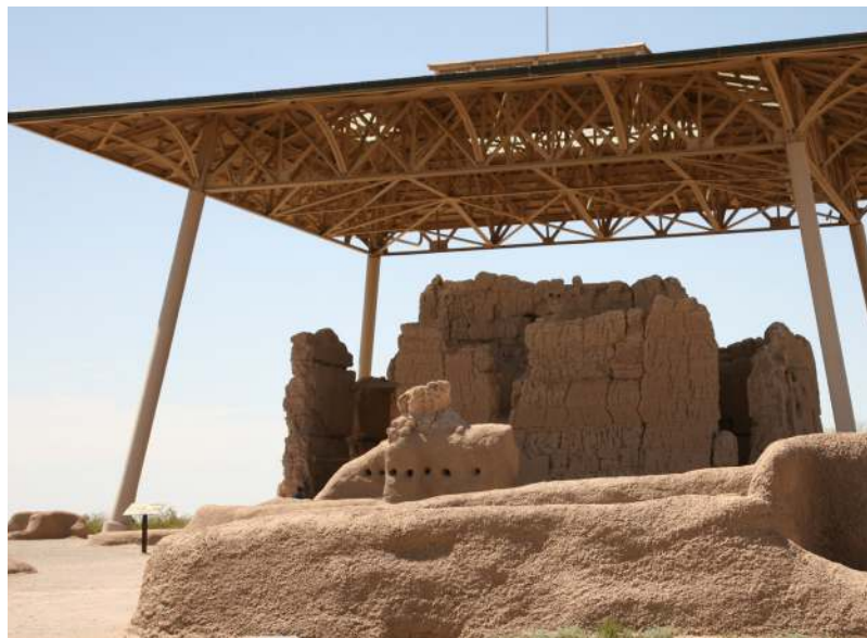
Casa Grande Ruins National Monument, Arizona, USA.

Again, the answer is yes and no. All peoples possess the inalienable right to manage their heritage, but Indigenous peoples were denied that right for a long time (and many still are). The term “Indigenous” has come to stand for peoples who have historical continuity with land and who have been affected by foreign political, legal, cultural, and economic impositions. As a result, the heritage of many Indigenous peoples has been destroyed or taken over by newcomers. For example, in 2013 developers in Belize demolished the 2000-year-old Nohmul temple without consulting contemporary Maya descendants. In the United States, the National Park Service allows rock climbing to continue on the natural formation, referred to in English as “Devil’s Tower,” despite the fact that recreational use is seen as sacrilegious by Native Americans who conduct ceremonies there. Because of the past and ongoing harms to Indigenous heritage, it is imperative that those engaging with Indigenous people and their heritage today do so with the utmost care and respect.