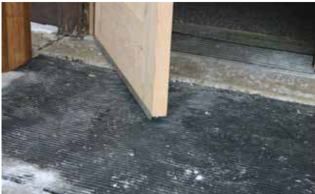
Former CPR Station, Portage la Prairie, MB. Adding weather-stripping to the refinished door provides a weather tight seal.

For more do-it-yourself information, see Manitoba Hydro's Power Smart Sealing, Caulking and Weatherstripping information booklet at www.hydro.mb.ca ; or call Manitoba Hydro at 1-888-MBHYDRO (1-888-624-9376) for a copy.