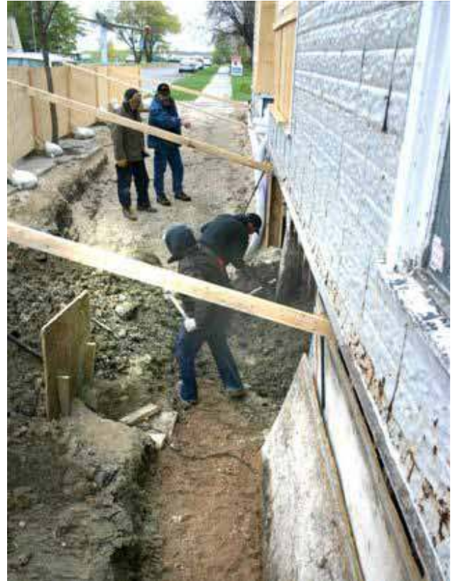
H.P. Tergesen and Sons General Merchant, Gimli, MB. Integrate improvements in energy efficiency into necessary repair work

For more do-it-yourself information, see Manitoba Hydro's Power Smart Energy Guide: Basement & Crawl Space Insulation information booklet at www.hydro.mb.ca ; or call Manitoba Hydro at 1-888-MBHYDRO (1-888-624-9376) for a copy.