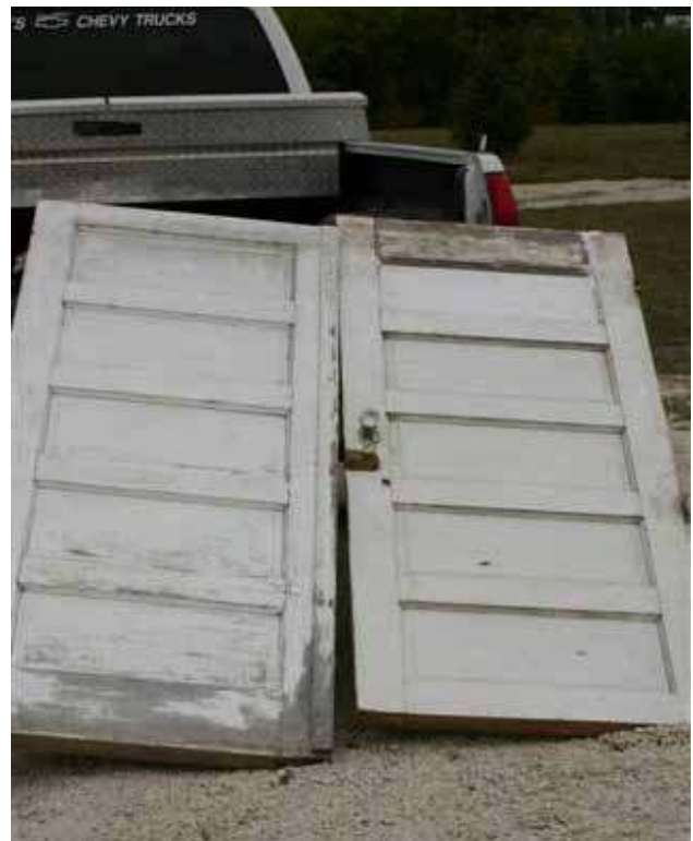
Church doors salvaged during building restoration project.

For more do-it-yourself information, see Manitoba Hydro's Power Smart Energy Guide: Wall Insulation information booklet at www.hydro.mb.ca ; or call Manitoba Hydro at 1-888-MBHYDRO (1-888-624-9376) for a copy.