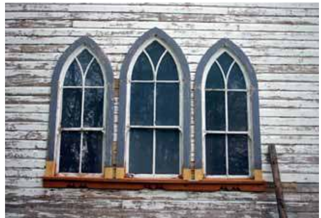
St. Paul's Anglican Church, St. Francois Xavier area, MB. Window frames are retained and repaired by piecing in new material to match the old

If you are interested in conservation but your building is not designated, you can perform your own assessment of the character-defining elements of the building. These often include: windows, exterior cladding, roofs, porches or entrances; and some interior features and finishes. (Note: The US National Park Service offers an excellent interactive website to help property owners identify the distinctive materials, features, and spaces of the building to conserve. Visit: Walk through Historic Buildings: Learn to Identify the Visual Character of a Historic Building at http://www.nps.gov/history/hps/tps/walkthrough/start.htm