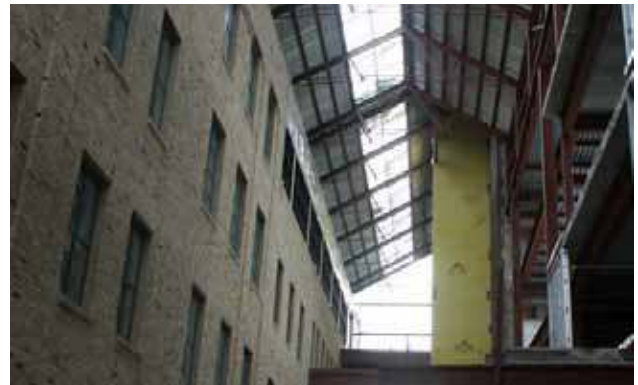
Red River College (Princess Street Campus), Winnipeg, MB The historic lane is preserved as a glass atrium between the two buildings. New and old technologies work together to achieve excellent energy efficiency for the building.

Although care must be taken, there are many improvements and retrofits that can work well in older heritage homes and commercial buildings. This guide will help building owners make informed decisions about which, if any, ecologically friendly changes to make and when to make them. The benefits of the suggestions in this guide are not limited to reducing ecological footprints . They also help preserve our heritage by extending the lives of buildings, while saving money.