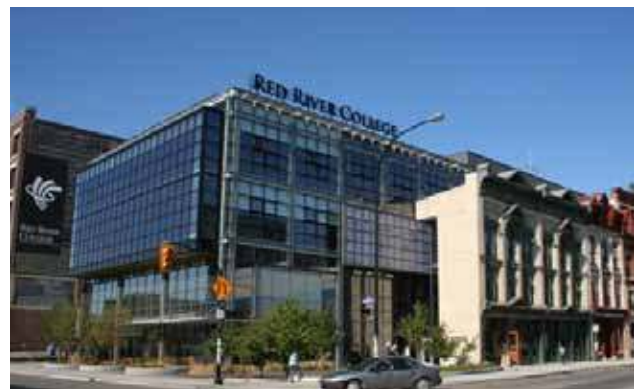
Red River College (Exchange District Campus), Winnipeg, MB Adaptive Re-use. The facades of heritage buildings along Princess Street are re-purposed for the new complex rather than demolished.