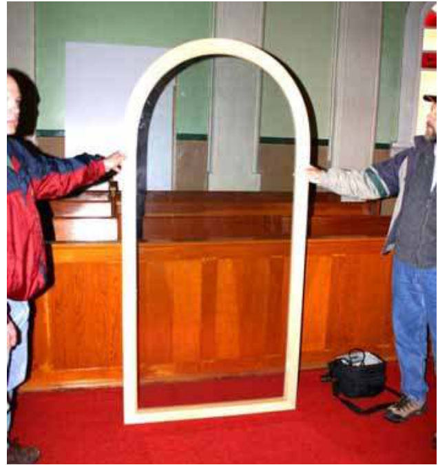
Immaculate Conception Ukrainian Catholic Church, Cooks Creek, MB. New wooden storm windows.

Storm windows can also be installed on the inside of the building. However, the outer sash (the historic window) takes the brunt of the weather and holds condensation in cold weather. Water that collects on the inside of the historic sash can cause decay. If using plastic sheets as interior storm windows, make sure they are removed periodically to allow the historic sash to dry. Also, make sure the historic frame and sash are completely caulked and weather stripped. Be careful not to damage historic window moldings and finishes. 12