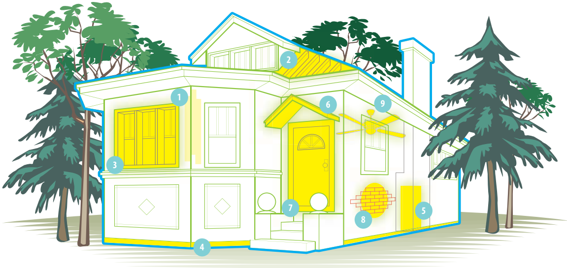
Illustration by mckibillo. Used with permission.

Energy efficiency upgrades to historic buildings should begin with the simplest and least expensive retrofits offering the highest potential for saving energy. With historic materials and systems, a typical “one-size fits all” approach may not be possible. Solutions adapted for the situation may be required. If necessary, contact professionals in historic conservation (ex: architects, engineers and mechanical contractors) for help.