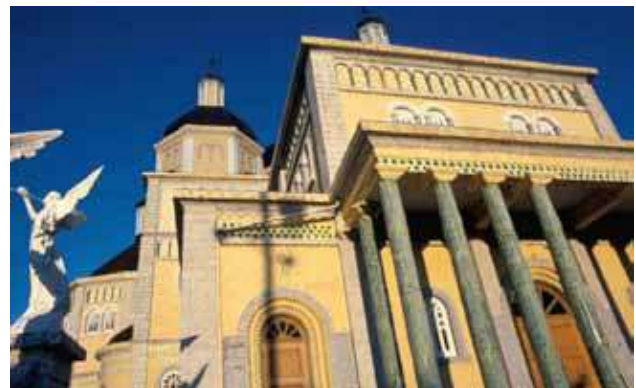
Immaculate Conception Ukrainian Catholic Church, Cooks Creek MB. New storm windows protect the historic wood windows while preserving the beauty and character of the original.

Drafts around windows usually occur because the frame has been improperly sealed or lacks insulation. Installing weather stripping around drafty windows can save nearly 25 per cent in building energy costs. Caulking around window frames can reduce air leaks around the outside of the frame by 90 per cent. 13