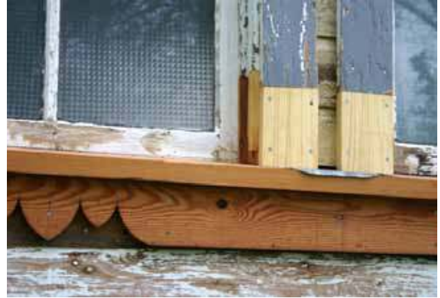
St. Paul's Anglican Church, St. Francois Xavier area, MB. Detail of repaired wood window frames

Retrofitting should be limited to measures that provide reasonable energy savings, at reasonable costs, with the least intrusion or impact on the character of the building. Overzealous retrofitting, which introduces damage to historic building materials, should not be done.