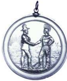
kiskinowâpisk, Treaty Medal