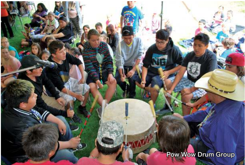
Pow Wow Drum Group