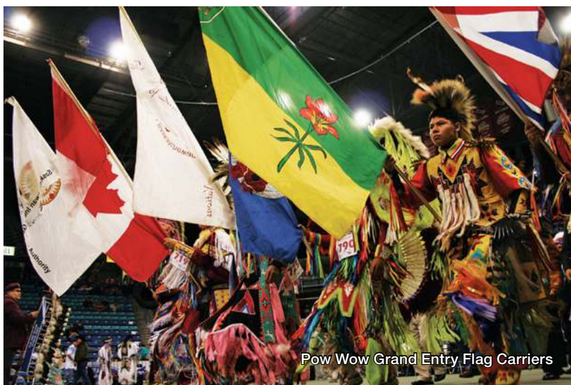
Pow Wow Grand Entry Flag Carriers

The SICC is an amazing resource for First Nations cultural information. The ceremonial information shown here was provided in partnership with SICC to help raise awareness of First Nations culture.