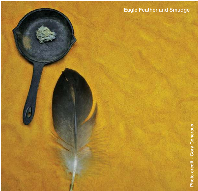
Eagle Feather and Smudge