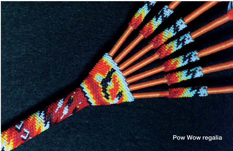
Pow Wow regalia