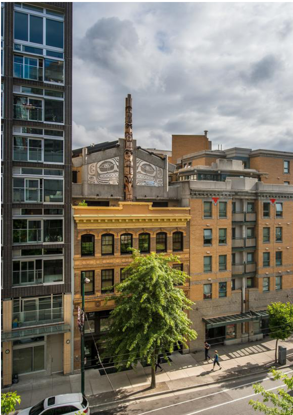
Skwachâys Lodge, Vancouver, BC

Provide leadership through clear and consistent heritage policies, effective heritage management tools, and meaningful heritage conservation incentives.