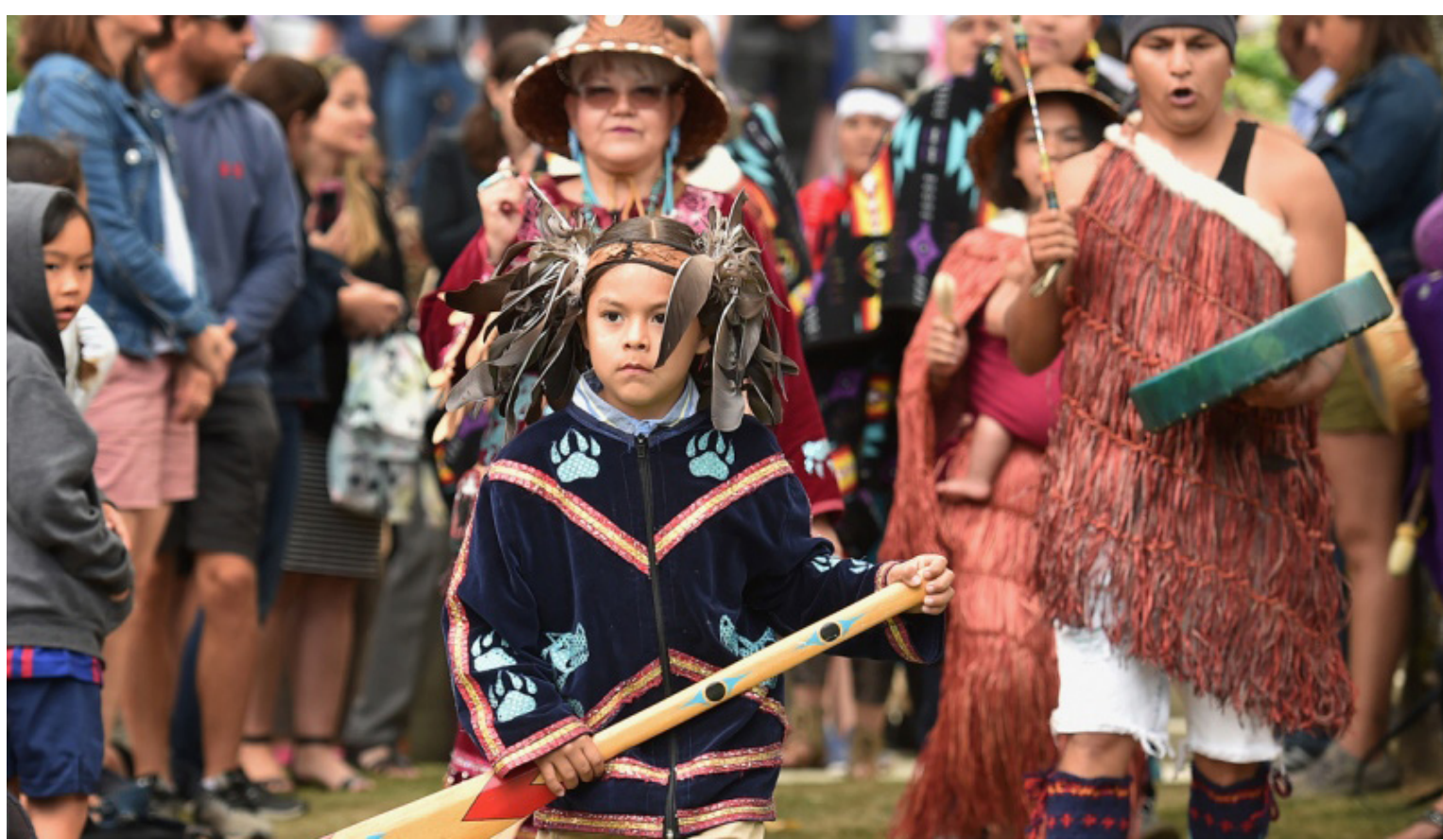
Members of the Coastal Wolf Pack, a traditional Musqueam dance group.