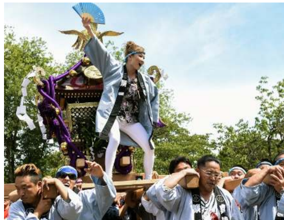
Top Left: African Descent Festival, Vancouver, BC, Top Right: Pinoy Fiesta, Vancouver, BC, Bottom Left: Diwali Festival, Vancouver, BC, Bottom Right: Powell Street Festival, Vancouver, BC