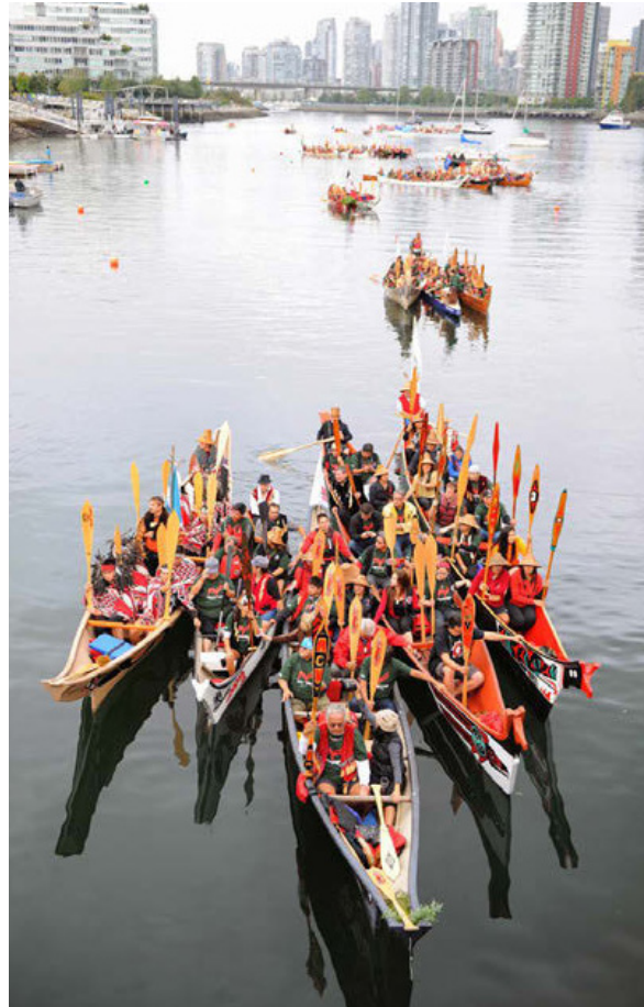
Top: Alhambra, Vancouver, BC. Bottom: Stanley Park Seawall, Vancouver, BC. Right: Gathering of Canoes in False Creek, Vancouver, BC