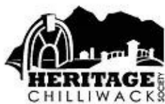
Heritage Chilliwack Society